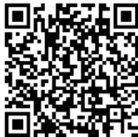
Infinity 9.3HS Datasheet

*Note the drawing above is of an Infinity Fan cooled laser.