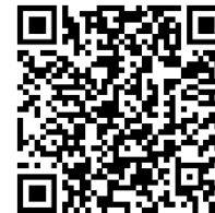
Infinity 9.3HS Manual